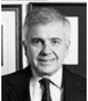
JUAN ANTONIO SAMARANCH