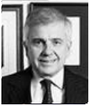
JUAN ANTONIO SAMARANCH